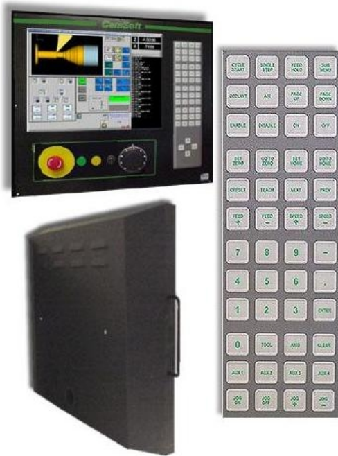
(Shown with Optional Rear Enclosure)

The CamSoft's Flat Mount CNC control offers a ready-to-go operator station with a large clear Hi Res color screen that has everything you need to replace that old control. The flat panel is large enough to fit over and flush mount over the opening of almost all other existing American, Asian or European brands. It is secured down with 8 counter sunk flat head screws.