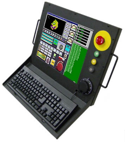
Virtual Touch Screen Keyboard Available

Computer, Software, Motion card, Terminal strip and Digital I/O sold separately, which we base on the requirements of the application.